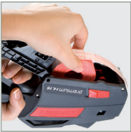
Quick and simple label change