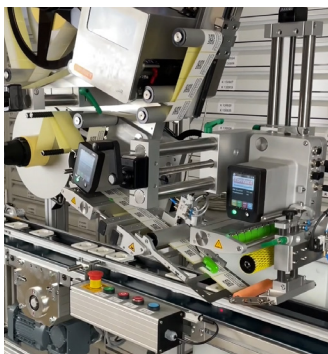
Print & apply labelling system