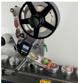
Label dispensing system