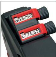
Devices available with word bands