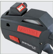
Label roll protected inside a full-shell housing