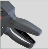
Ergonomic design - comfortable & easy to grip

Experience the benefits of our contact premium labellers: