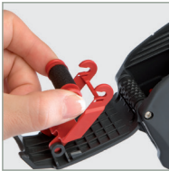
Clean and effortless ink roller replacement