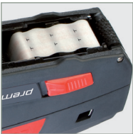
Reliable and precise label transport