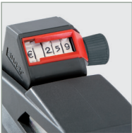
Variable print sizes