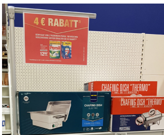
Special placement solution