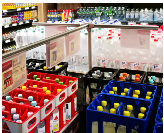
Floor construction / Floor space solution